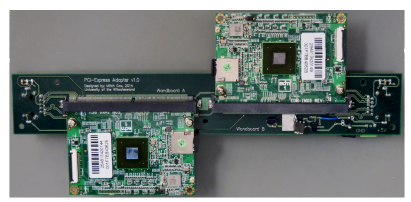
Fig. 2. PCI-Express test setup for a pair of i.MX6 SoCs (Wandboards)

Initial throughput measurements presented for a pair of Freescale i.MX6 quad-core Cortex-A9 SoCs are 72 % of the theoretical maximum 500 MB/s for the available x1 link. Six of these SoCs would therefore be connected in parallel to provide 20 Gb/s throughput at a power consumption of less than 50 W. As a proof of concept the final Cortex-A9 prototype aims to provide 20 Gb/s aggregated throughput.